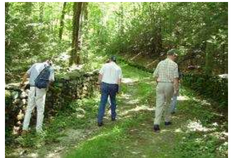
Hikers on Jones Mountain Carriage Road

(Parking .8 miles on left up Steele Road from downtown New Hartford/Library/intersection Steele Rd., Central Ave. & Rte 219/Town Hill Rd.)